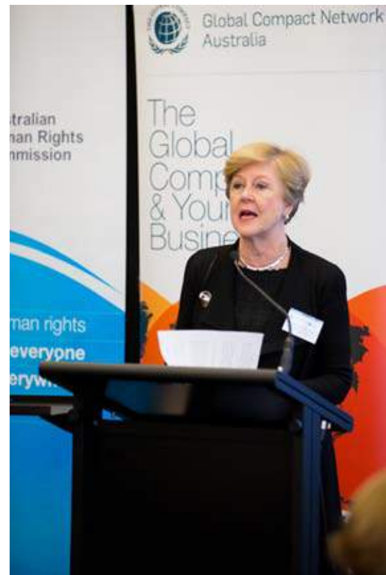
Professor Gillian Triggs (President, Australian Human Rights Commission) at the 2015 Australian Dialogue on Business and Human Rights.

The Dialogue highlighted that the discussion had largely moved beyond "why" business should respect human rights, to practical questions around "how" to effectively do so.