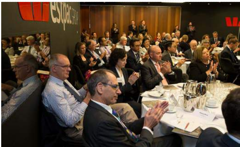
Participants at the launch of DFAT's private sector engagement strategy and GCNA / DFAT partnership.

The workshop also highlighted that there are already large-scale commitments from Australian companies to sustainable development and provided some useful models for potential business alignment with the SDGs.